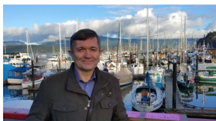
Ross on Vancouver Island