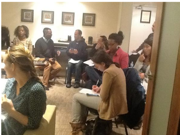
Some of those gathering in Calgary studying the Scriptures at 'Simply churching' workshop in January.